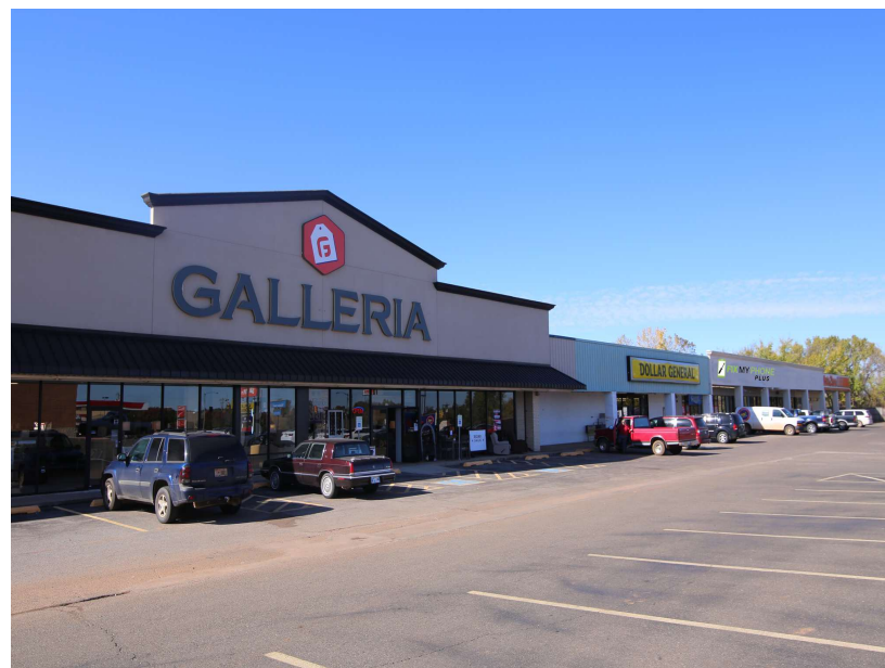
Galleria and Walgreens are separately Owned

ROSHA WOOD 405.239.1219 rwood@priceedwards.com priceedwards.com