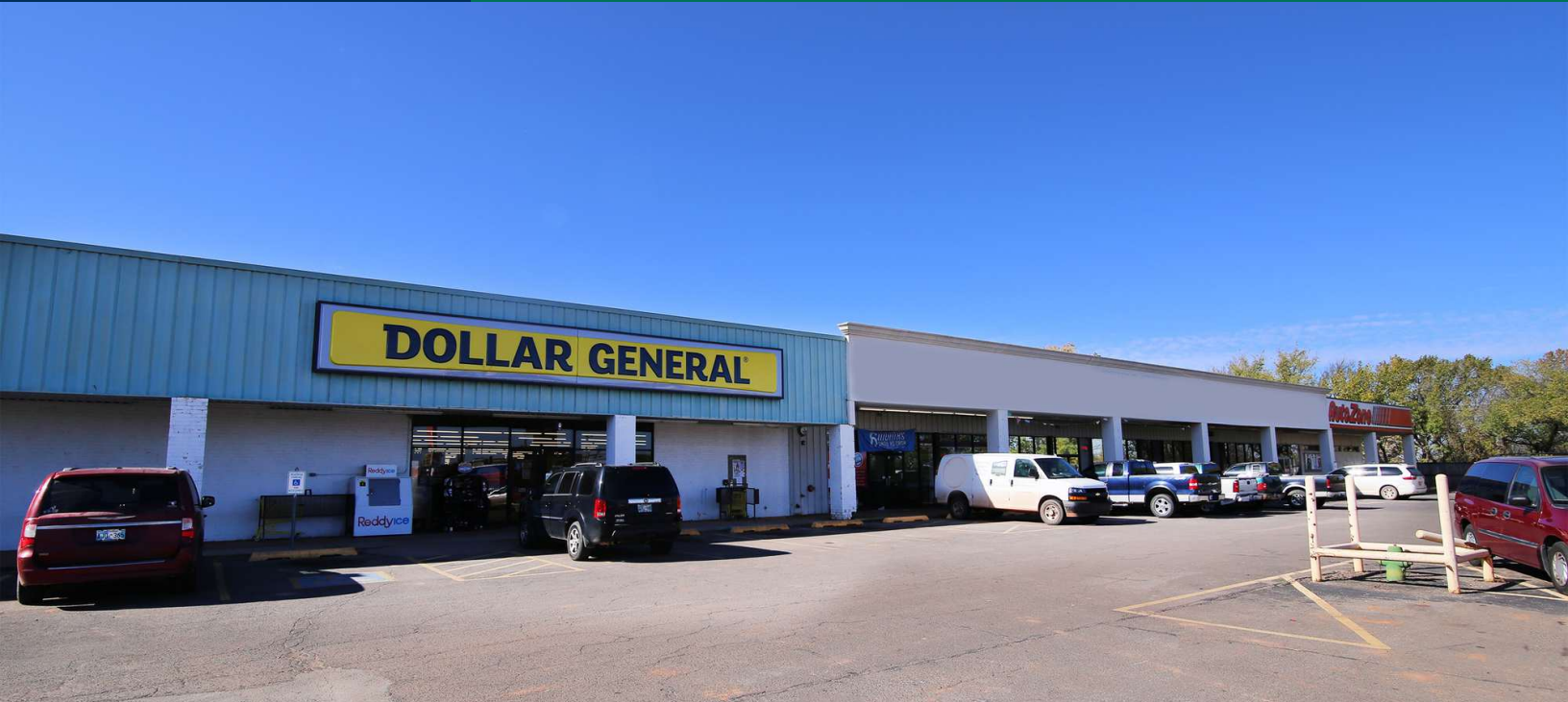
This Center is 100% occupied with Scooters Coffee in the parking lot