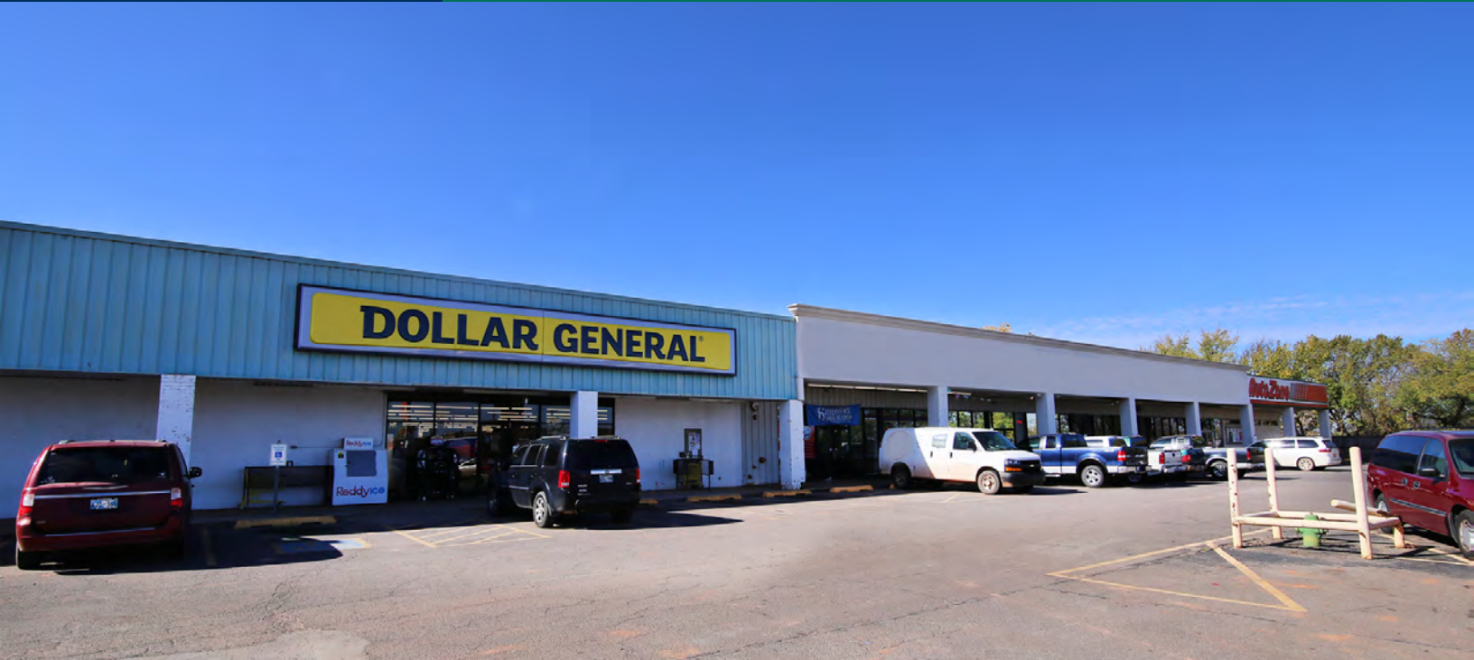
This Center is 100% occupied with Scooters Coffee in the parking lot