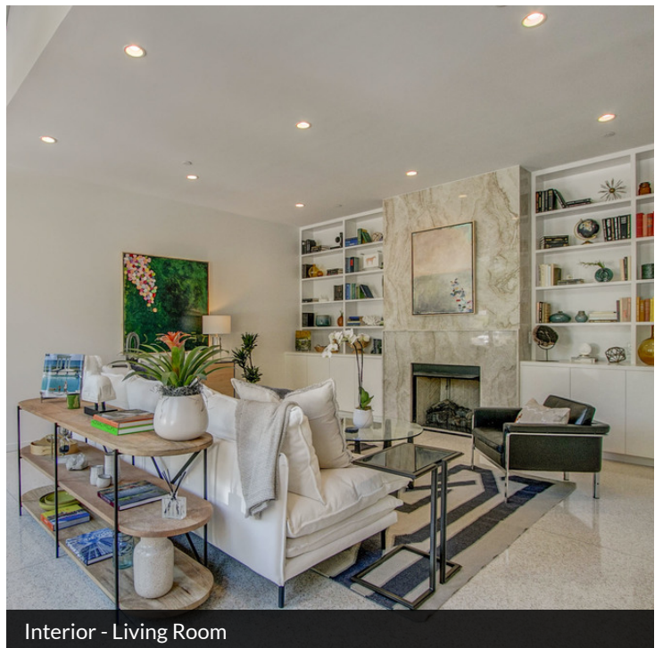
Interior - Living Room