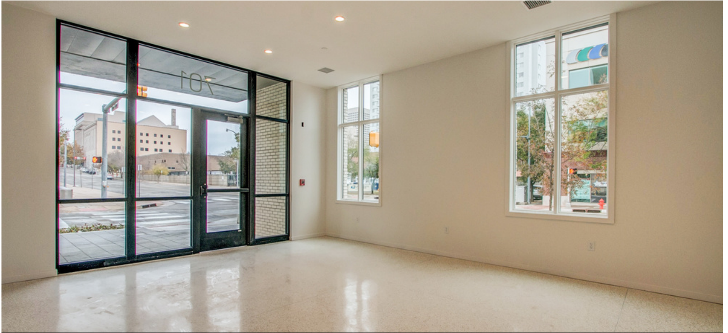
Interior - Work space with private entrance