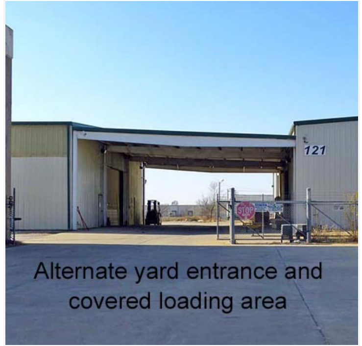
Alternate yard entrance and covered loading area