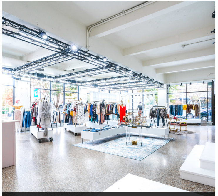
Interior facing the corner of 10th & Broadway. Lighting can stay in suite.