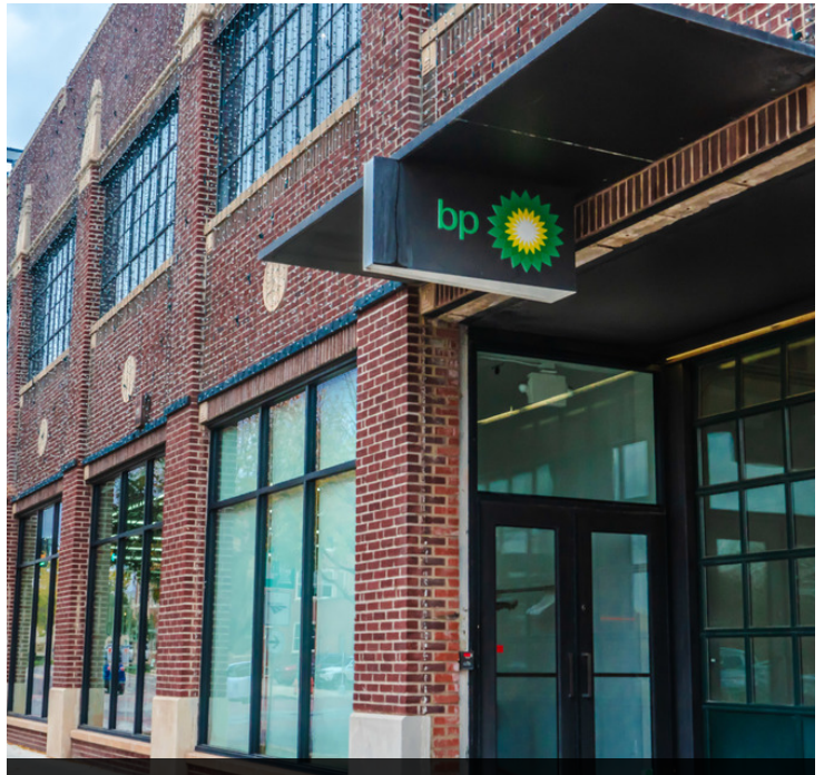
Exterior - second entrance on 10th Street