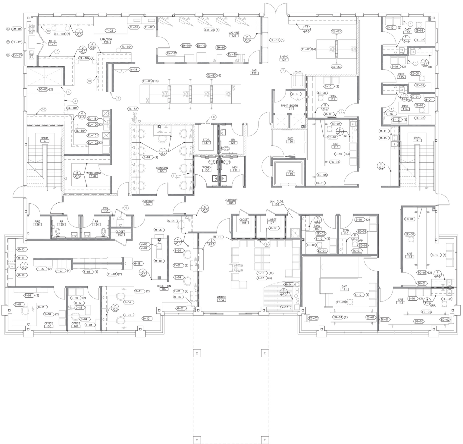
1st Floor - Floor Plan

4207 W MEMORIAL RD, OKLAHOMA CITY, OK 73134