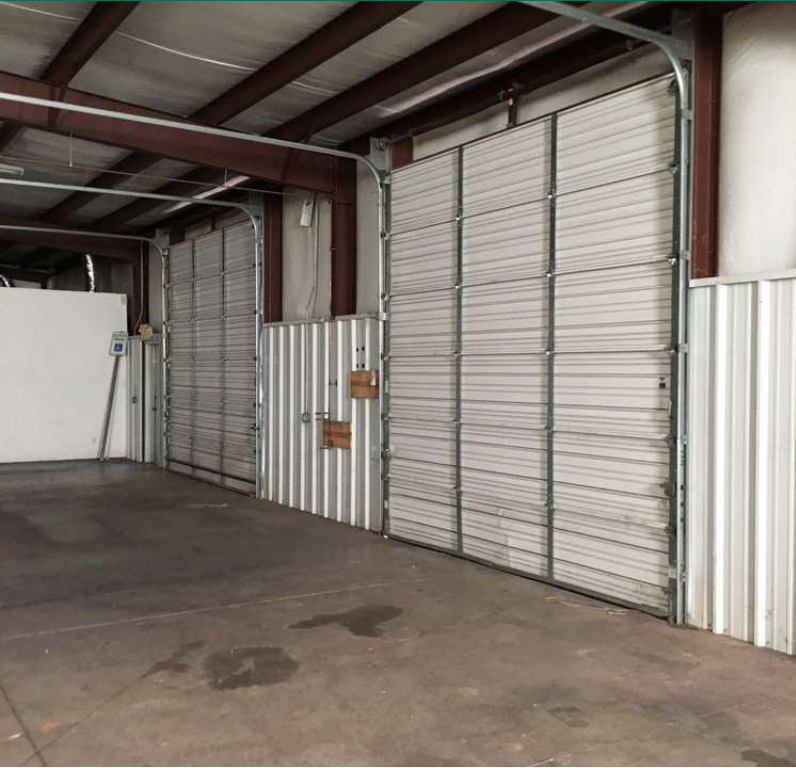
7424 NW 84th +/- 4,000 sq. ft. 800 SF Office/3,200 SF Heated Warehouse, MOL