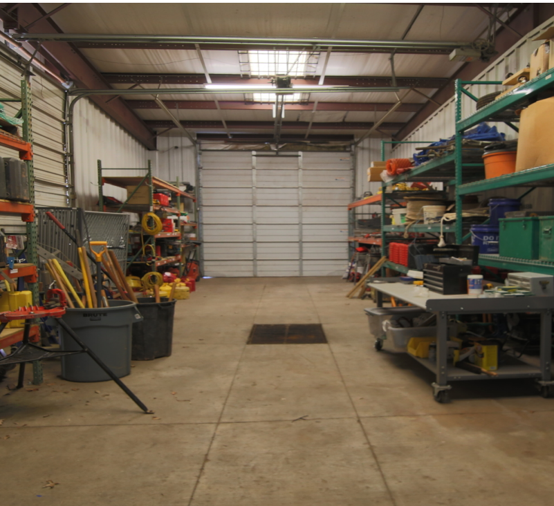
Floor Drain & Wash Bay