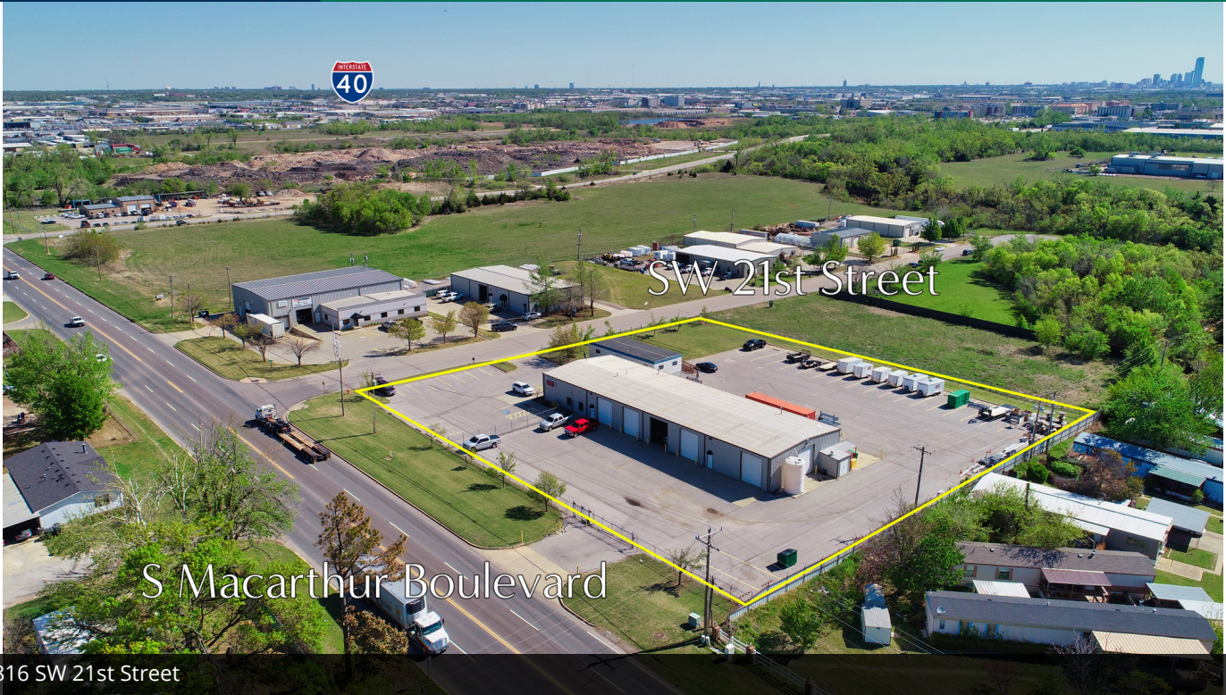
Aerial of 5816 SW 21st Street