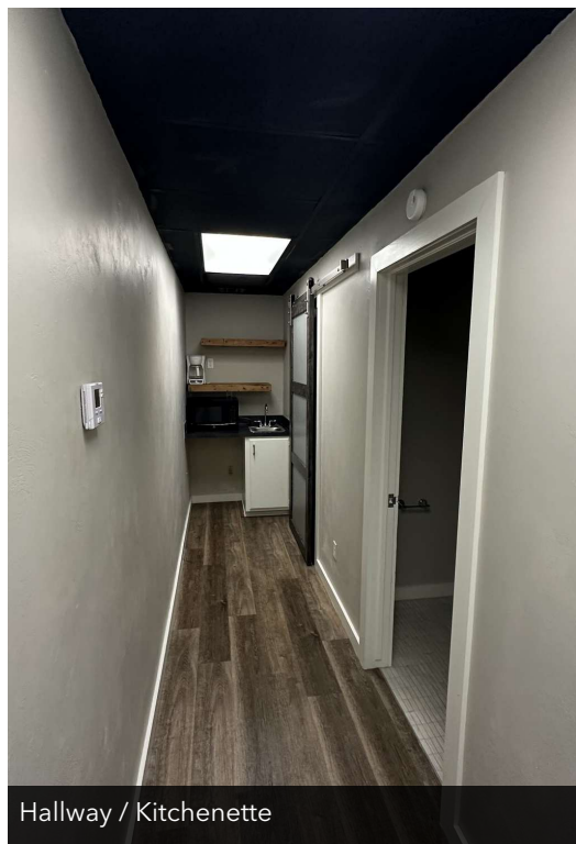
Hallway / Kitchenette