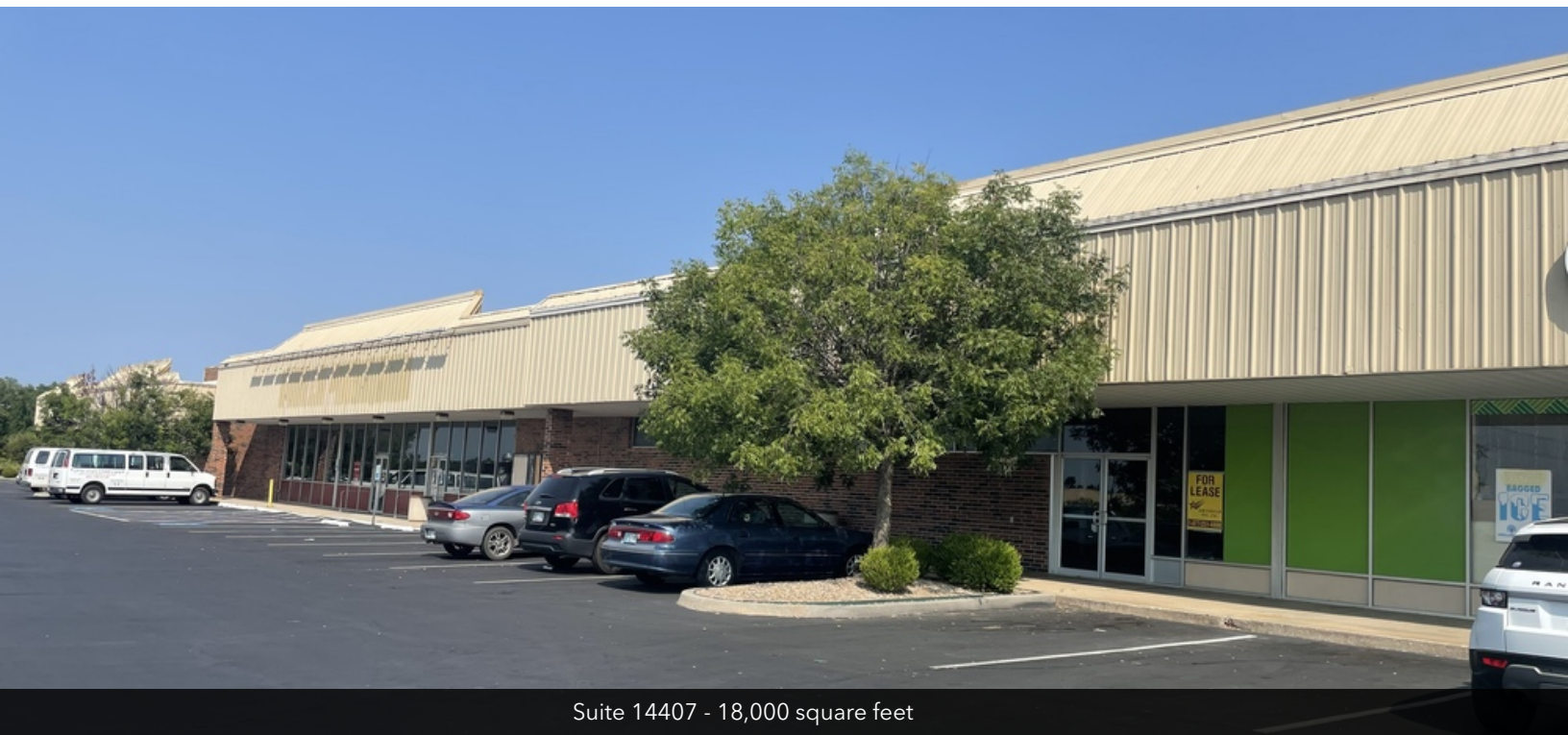
Suite 14407 - 18,000 square feet