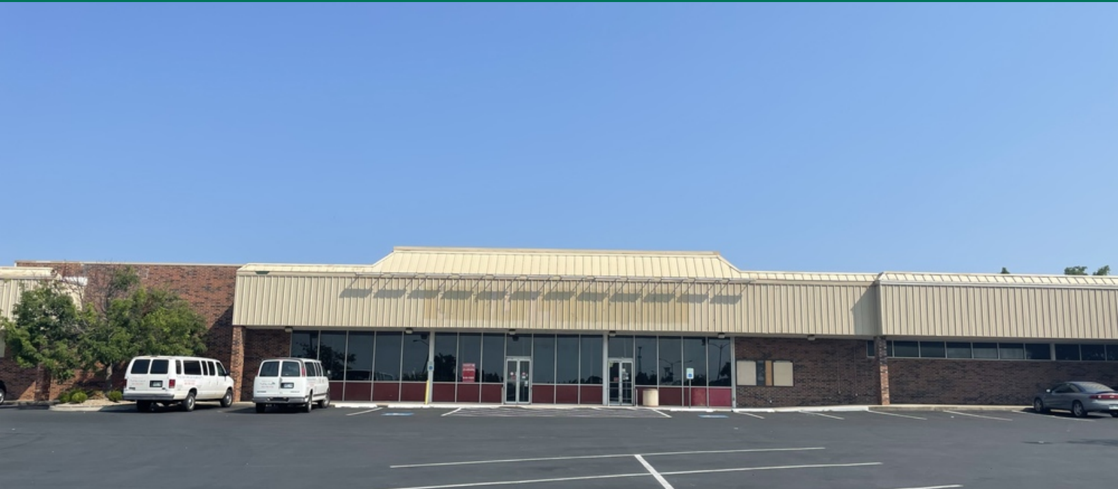
Suite 14407 - 18,000 square feet